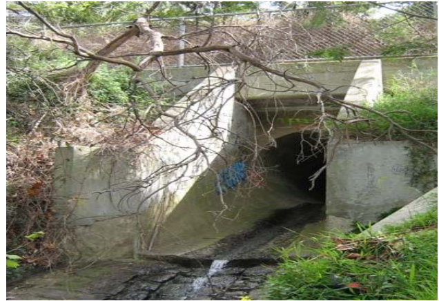
Urban storm water site examined using MST suite in the recent Smart Water Fund study.